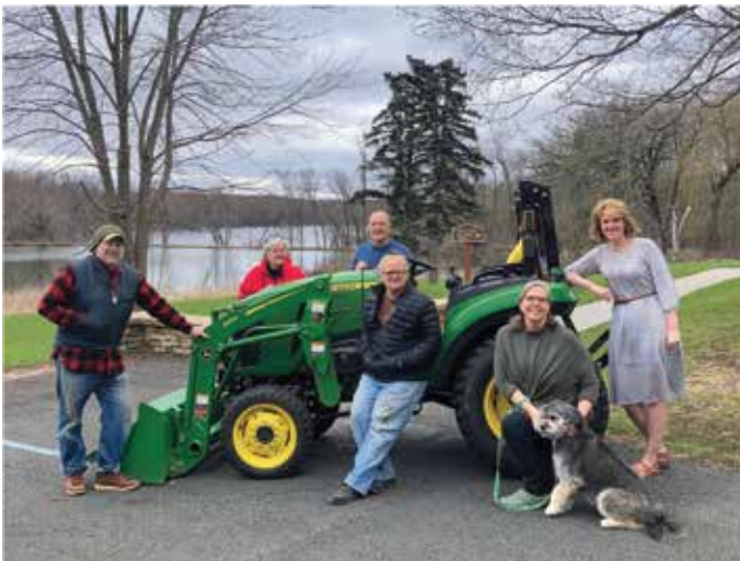
Meet "Brother Leonard" - our new tractor!